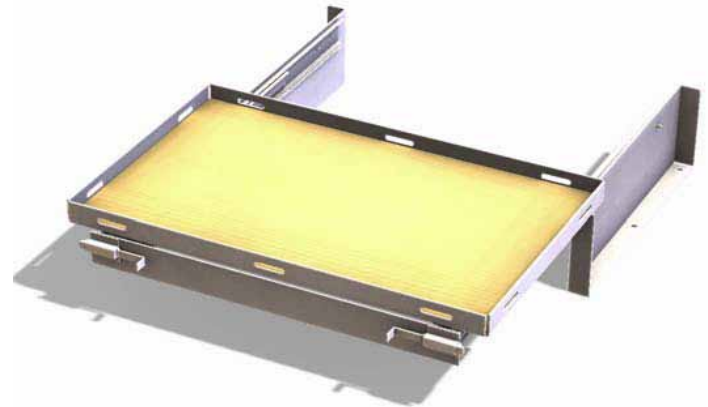
TBT1 with full slide extension.